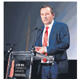
Premier Mark McGowan addresses the awards.

The winners each receive leadership and management training to the value of $20,000 to donate to a charity of their choice and an engraved Pinnacle trophy.