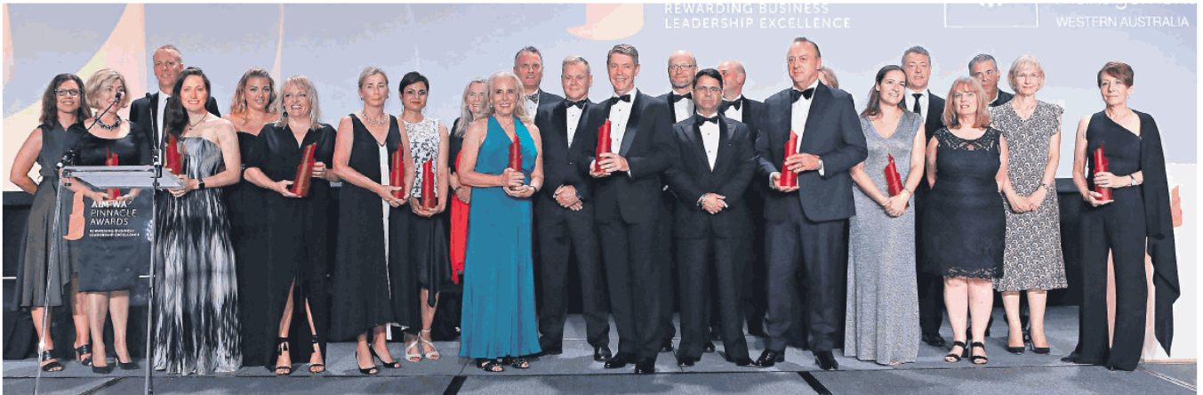
All of the winners at the Australian Institute of Management WA Pinnacle Awards.